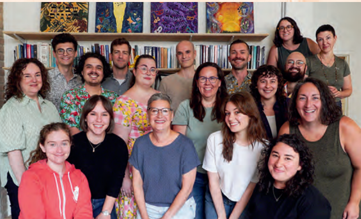
Team Mishkan 5786: Our full-time staff and clergy.